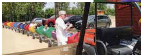
Barrels of Fun (Left) - FREE

Check out the Hidden Valley Express Rides every Saturday $2 per person