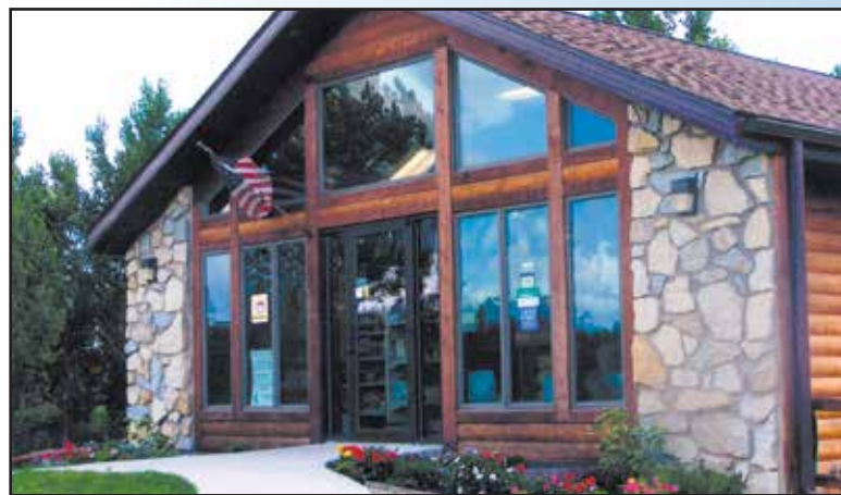
Our clubhouse houses video game, and meeting rooms plus a store for your convenience.

Just call with your credit card number, and we will send you your certificate.