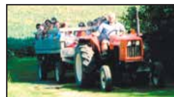
Free hayrides every Saturday from Memorial to Labor Day.