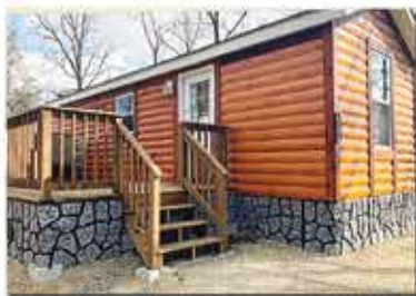
Full Service Cabins