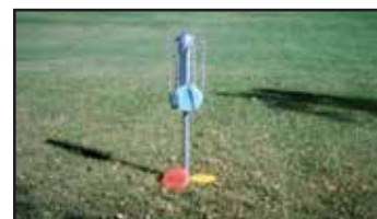
9 holes of Frisbee Golf.