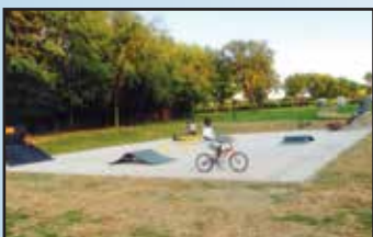
Check out our skate park.