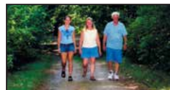
Hiking trails - We have several hiking trails at Milton-KOA. Enjoy a walk through the woods or the open country side.